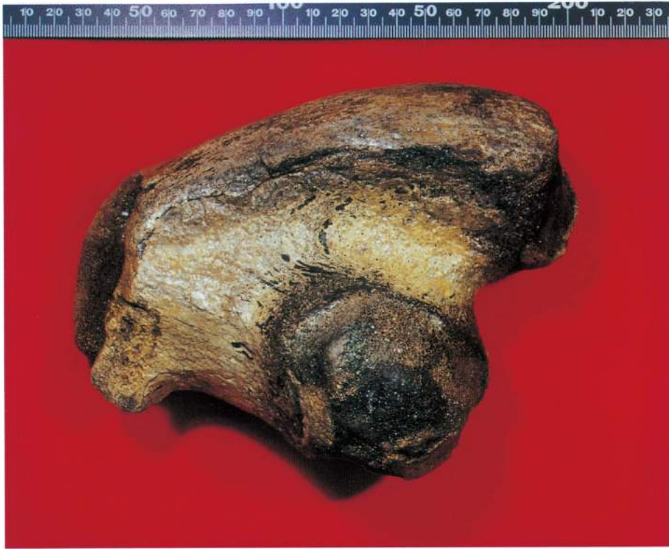
Plate 1. Right humerus of Mesodermochelys undulatus Hirayama and Chitoku, NMV-3, from the Lower Campanian of Nakagawa-cho, Hokkaido. A: dorsal view, B: ventral view.